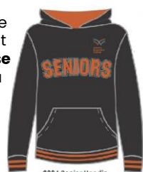
2024 Senior Hoodie $80.00

https://onlinestore.devonclothing.com.au/commemorative/schools/whyalla-secondary-college/